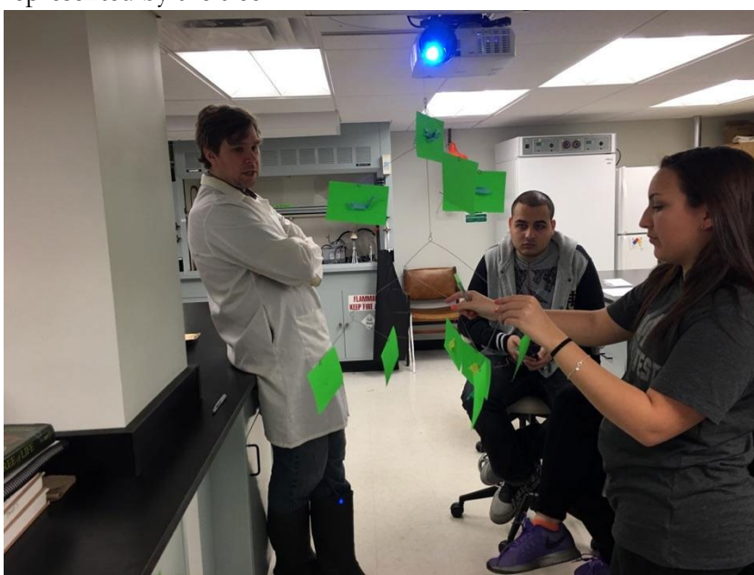
Figure 1. Students construct a phylogenetic tree using a mobile and index cards. The instructor critiques.

By the end of this activity, students should be able to construct and describe a phylogeny of sample specimens of animals and seaweeds using a mobile to model the phylogenetic tree (Fig. 1). They should be able to identify the parts of a phylogenetic tree and state a hypothesis represented by the tree. Using the phylogeny they construct they will be able to state verbally the hypotheses represented by the tree.